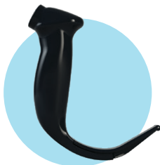
SPECTRUM™ SINGLE-USE VIDEO LARYNGOSCOPE