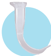
SINGLE-USE GVL® STATS