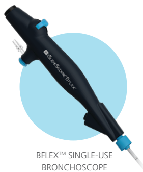
BFLEX™ SINGLE-USE BRONCHOSCOPE